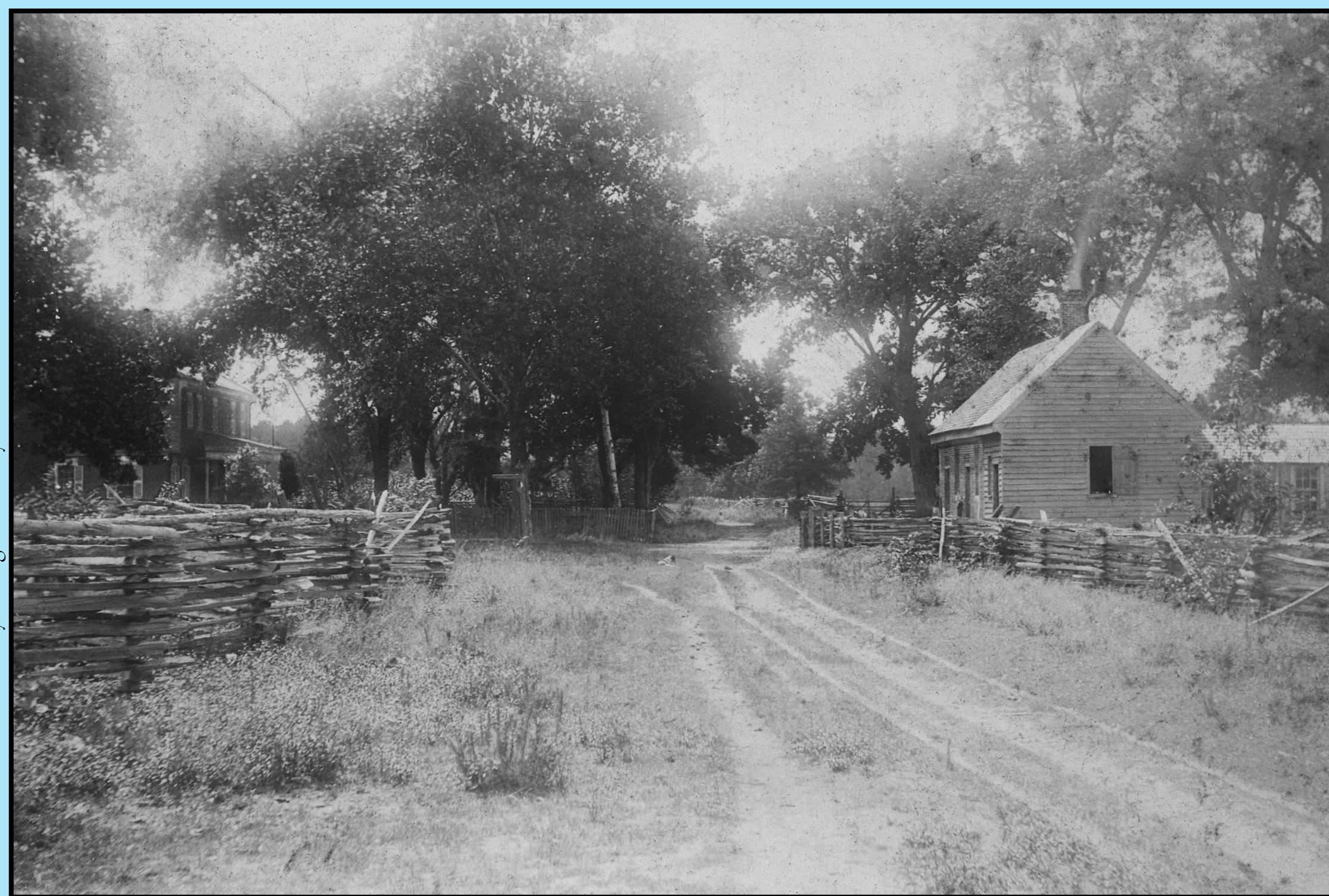
Cross Keys (showing old storehouse in which some of insurgents were imprisoned).

his family's escape. Later, he would attend the United States Military Academy and serve as a leading Union general during the Civil War.