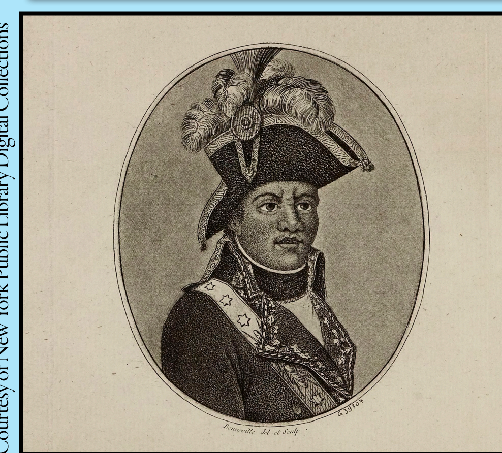
Toussaint Louverture, leader of the 1791 overthrow of the French colonial regime in Haiti, inspired Gabriel Prosser.